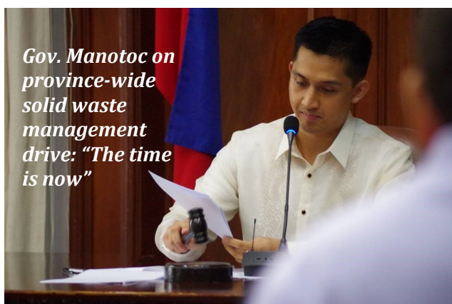
Gov. Manotoc on province-wide solid waste management drive: “The time is now”