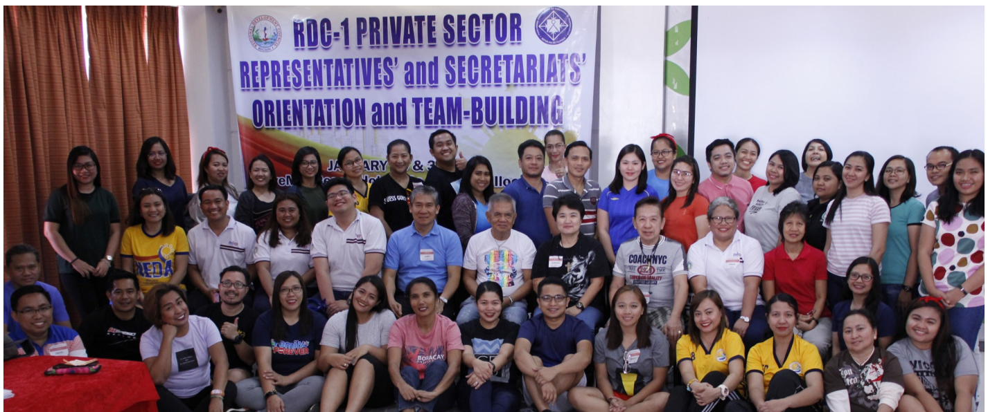
Regional Development Council 1 (RDC-1) Private Sector Representatives (PSRs) and committee secretariats participate in the RDC-1 training and team building on January 30-31, 2020 at OveMar Resort in Sta. Catalina, Ilocos Sur.