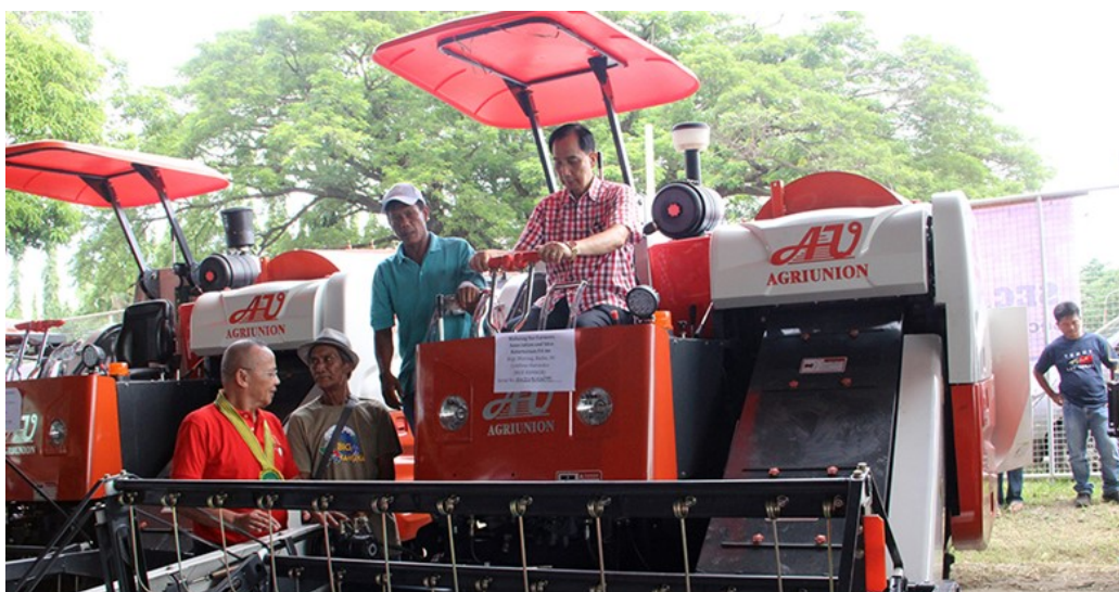
In this file photo, Agriculture Secretary William D. Dar tests a combine harvester farm machinery before he turns-over to the farmers' organization in Badoc, Ilocos Norte during the recent awarding rites in Mariano Marcos State University (MMSU) Auditorium, Batac City, Ilocos Norte.