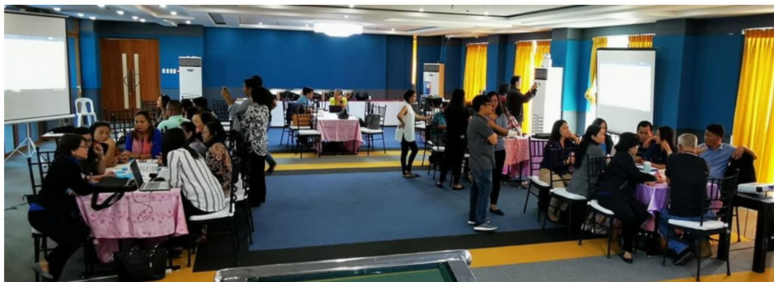
Participants brainstorm with the assistance of NEDA-I personnel. They were grouped according to the functions of NLPSC – Instruction, Research, Extension and Production.