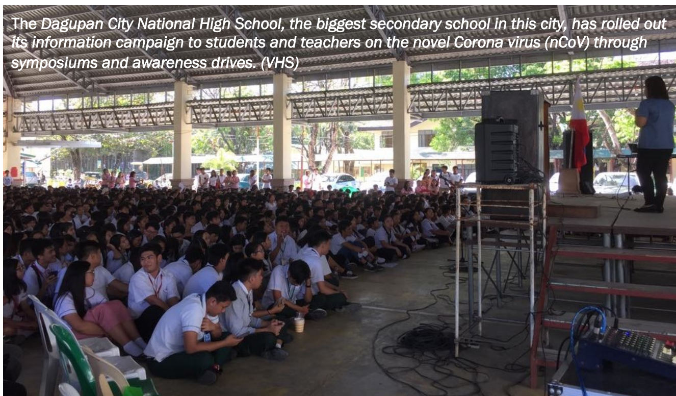
The Dagupan City National High School, the biggest secondary school in this city, has rolled out its information campaign to students and teachers on the novel Corona virus (nCoV) through symposiums and awareness drives. (VHS)