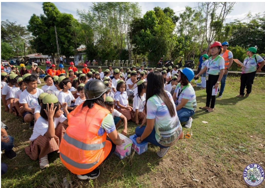
4TH QUARTER NSED. Students of Cabaroan-Cabalangean Elementary School in Vigan City, Ilocos Sur participate in the 4th Quarter Nationwide Simultaneous Earthquake Drill (NSED) spearheaded by the City Disaster Risk Reduction and Management Office on Thursday, November 14. NSED, a major endeavor spearheaded by the Office of Civil Defense (OCD), is comprised of a series of simulation exercises conducted all over the Philippines to instill a culture of disaster preparedness among Filipinos and promote disaster

A post from the OCD's Facebook page showed that students, faculty and staff of Caba Central School as well as municipal employees, market vendors and locals performed the "duck, cover and hold" technique during